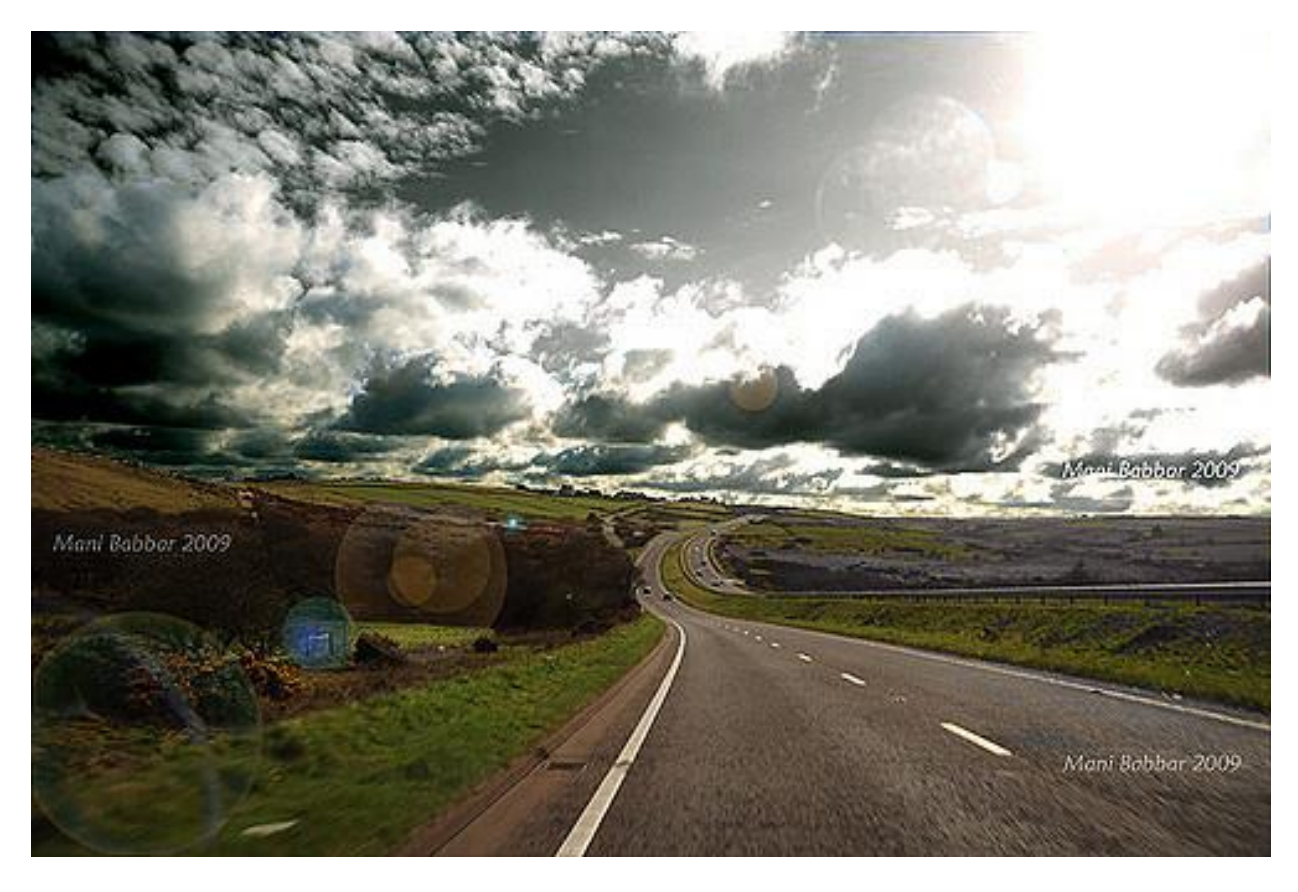
Strategy and Creativity Matter