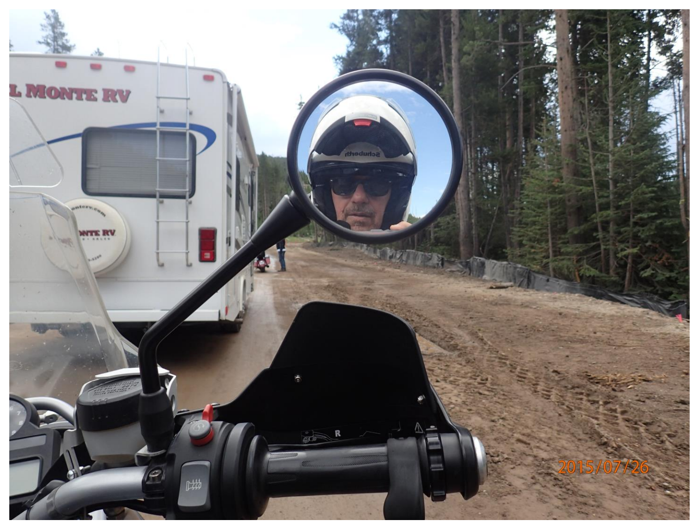
Strategy and Creativity Matter